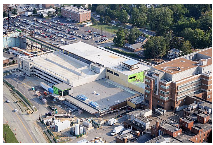
Figure 1

completed in May 2012. Whiting-Turner was chosen as